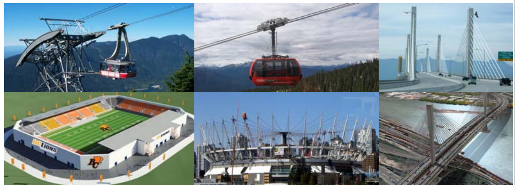
1978: Grouse Mountain Tram 2010: Temporary Empire Field