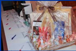
Silent Auction 2011 — Thank you to our donors:

Phone (604) 688-7947 Fax (604) 687-7945 E-mail chamber@swissccc.com