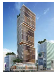
Telus Garden, Vancouver Will be built to LEED Gold Standard